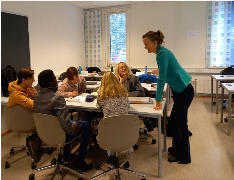
figure 2 Teaching EDSL